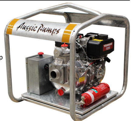
QP205SE/L48 Mine Spec